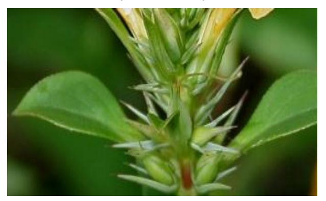
Leaf & spine