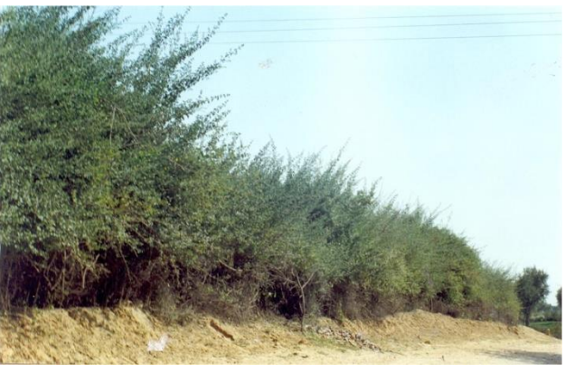
Live fence of Arni (Clerodendrum phlomidis)