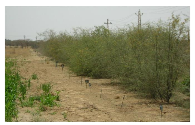
Live fence of Bawli (Acacia jacquemontii)