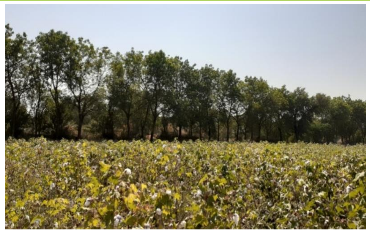
Shelterbelt of Azadirachta indica protecting cotton crop