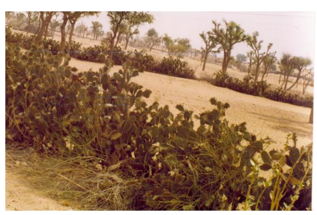
Live fence of Hathathor (Opuntia elatior)