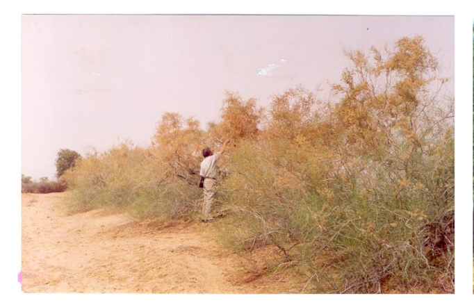
Live fence of Phog (Calligonum polygonoides)